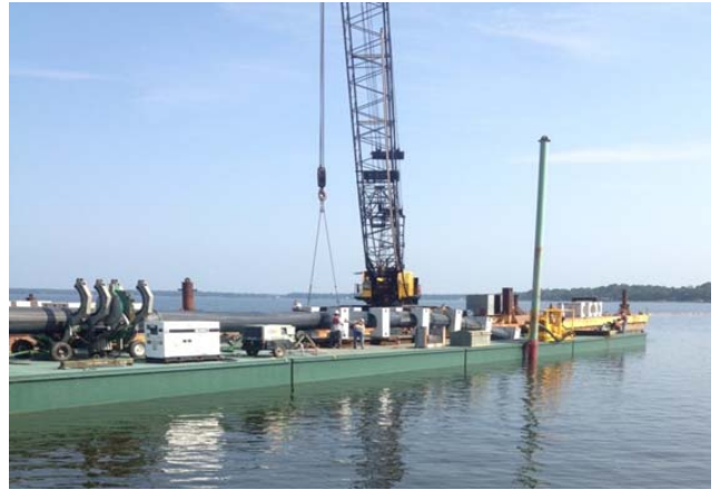
The photo above depicts the barge used for installation of pipe across Choctawhatchee Bay.

Our WRP Phase IV water supply project is progressing well along the west side of Hwy 331. As you may have seen through your travels construction crews are diligently working installing pipe from the existing wellfield south to the courthouse annex. Our contractor, Hemphill Construction has completed approximately 70% of the work and anticipates an early completion by mid spring. Polyengineering, Inc., our consulting engineering firm, is aiding in the oversight of construction.