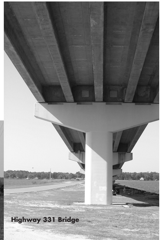
Highway 331 Bridge