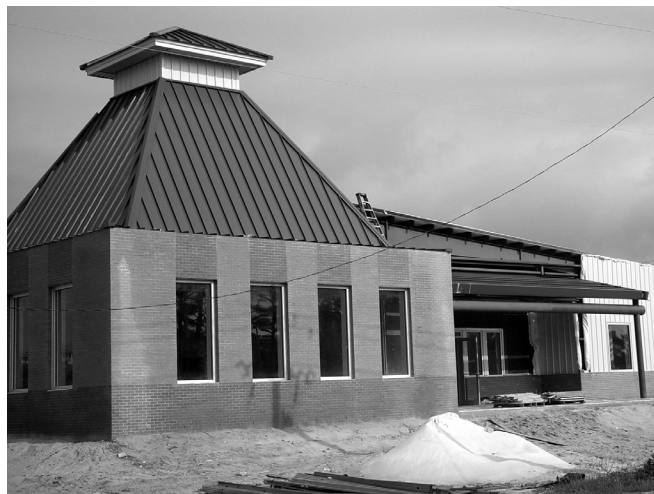
SWUCI's new Field Maintenance Facility

South Walton Utility Company, Inc.'s (SWUCI) new Field Maintenance Facility is under construction at 369 Miramar Beach Drive. The project includes approximately 9,000 square feet of new warehouse space and 7,000 square feet of new office space. The facility should be completed in July.