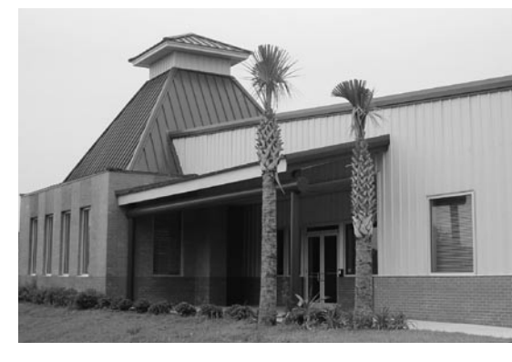
The new SWUCI Field Maintenance Facility

Additional improvements are in progress. Currently, construction on the Phase II parking area and pavilion is underway, which will provide more space for SWUCI support staff and employees.