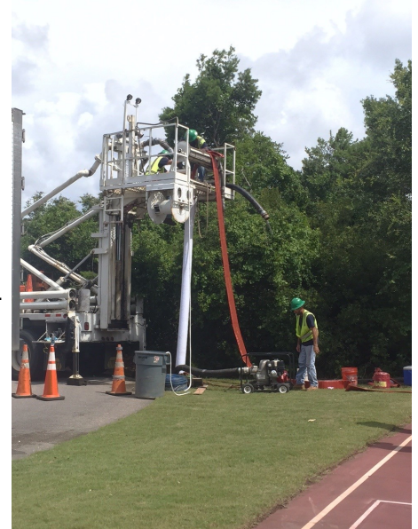
Workers prepare lining for gravity sewer pipelines.

In the near future you will see a lot of happenings along Hwy 98 from Tang-O-Mar Drive to Destin Commons. The Florida DOT is gearing up to 6 lane Hwy 98 and with that creates challenges for all your utilities. We will be relocating a large portion of our lines to accommodate this project. Please be cautious, be alert and patient with our efforts to meet the demands of growth in our area.